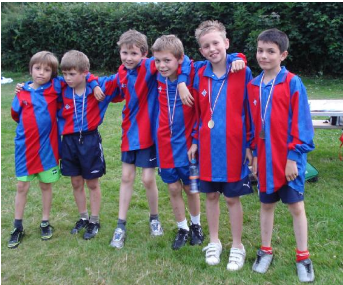
The winning team from the 12 th Enfield Pack.