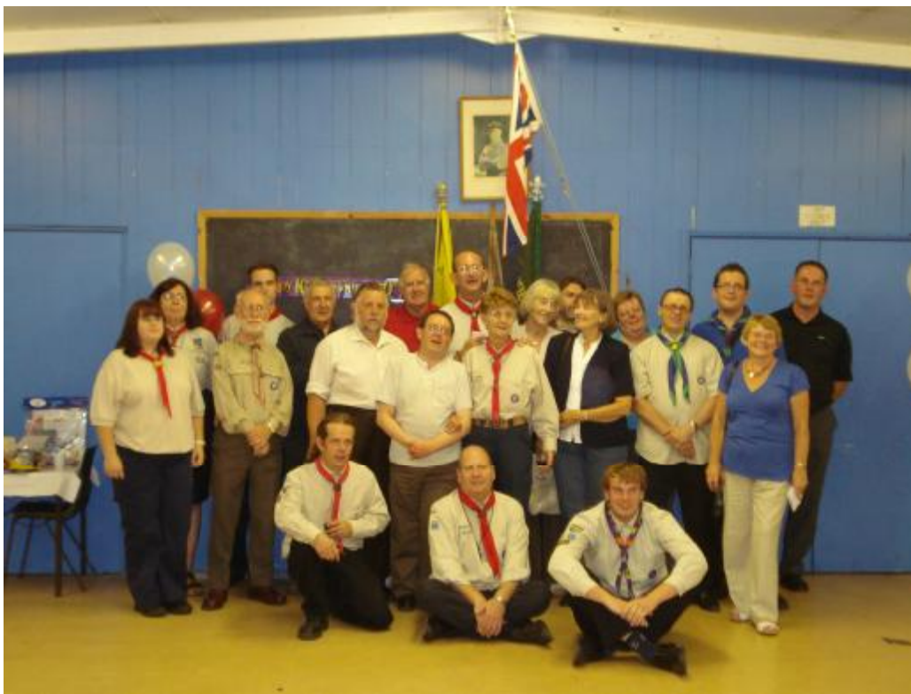
Past and present Leaders of the 1 st Enfield Group at their centenary celebrations

The Group suffered a lot of problems in the late 1980s and 1990s which almost led to its closure, but in recent years it has seen a change of fortunes and is, at present, in a very strong position.