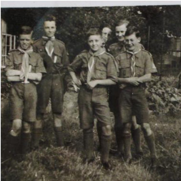
A team of Scouts from the 15 th Enfield who erected air raid shelters in 1942.

The Birchbark camping competition actually started in 1941 – the original trophy was a piece of bark from a birch tree.