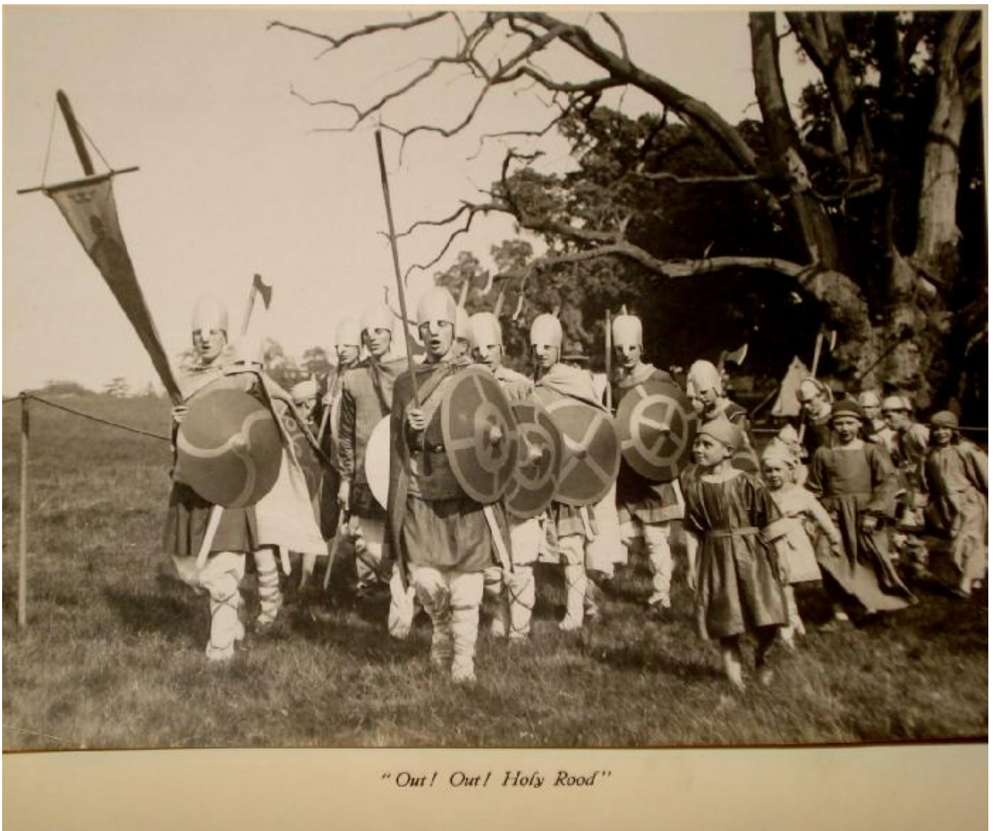
"Out! Out! Holy Rood"