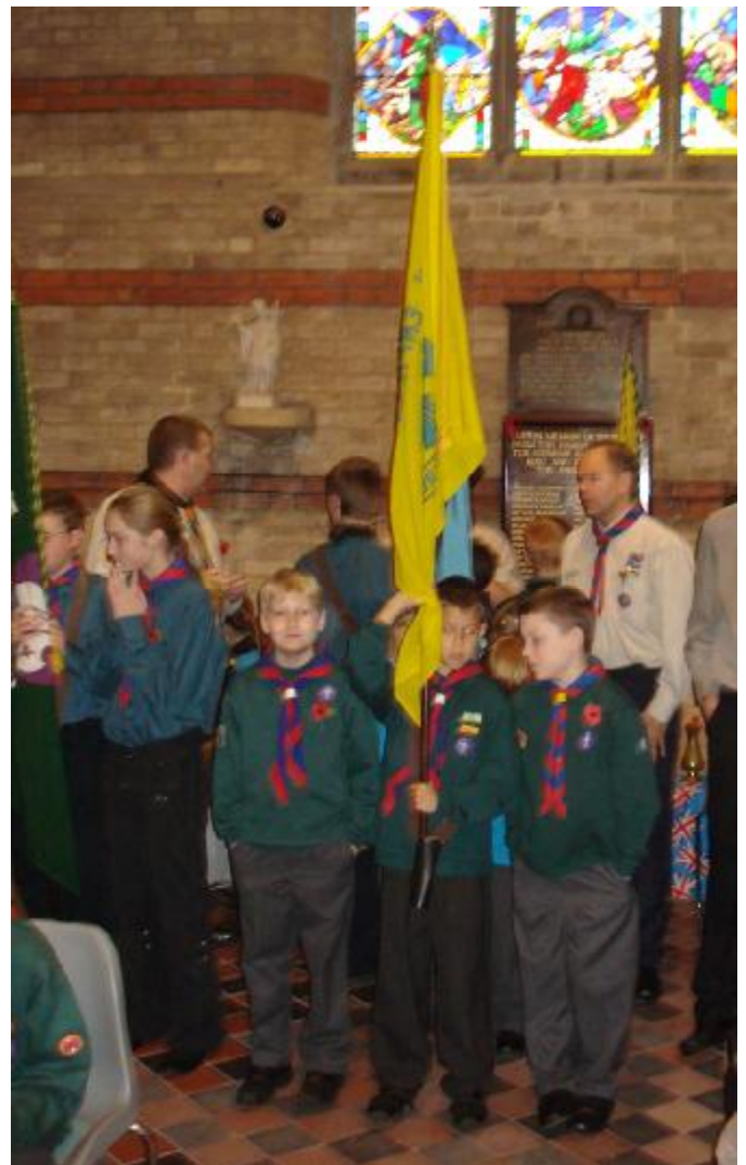
Colour parties forming up in St. John's church before the Remembrance Sunday service