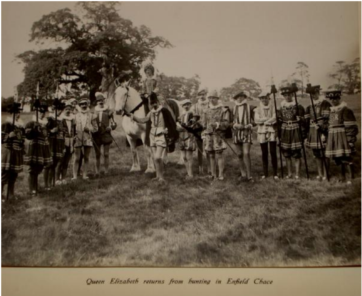
Queen Elizabeth returns from hunting in Enfield Chase

The elaborate costumes were all home-made by the Scouts, Scouters and parents. The cast included a real live horse and dog! There were no girls in the Scouts then, so boys had to play the female parts as well!