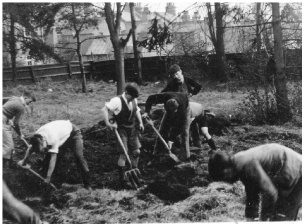
The 6 th Enfield had an allotment in the St. Luke’s Vicarage garden (where St .Luke’s Avenue now stands). Here we see them “digging for victory”.

The Scouts also helped with the war effort by erected “Anderson” air raid shelters, growing vegetables on allotments as part of the “dig for victory” campaign. There was also considerable rivalry between the Scout Troops as to who could raise the most money for the “BP Memorial Fund” to help the war effort.